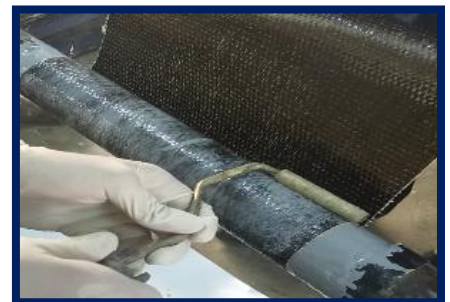
3. Composite Wrapping

For more information, please contact our representative: