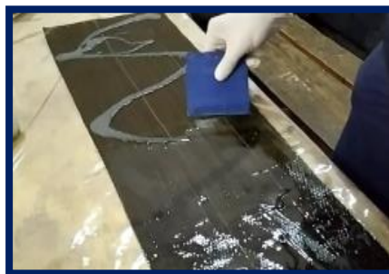
2. Saturation of fiber