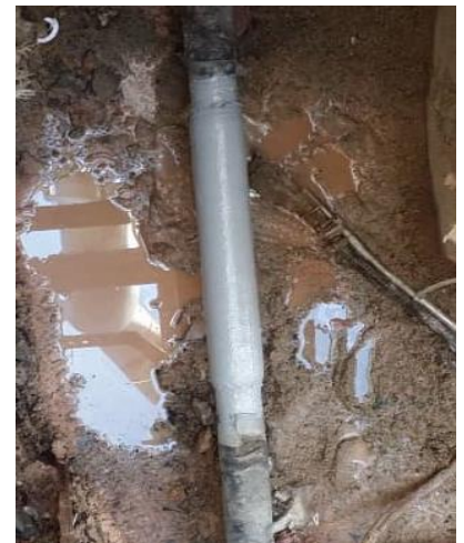
Figure 2.0: Condition of pipe after top coat application