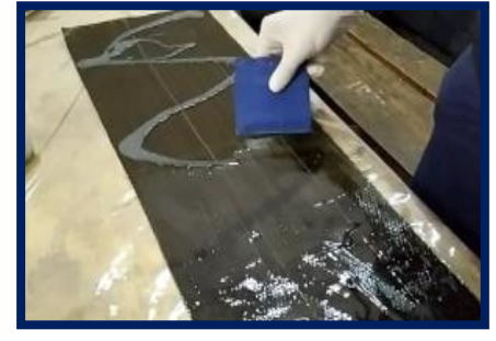
2. Saturation of fiber