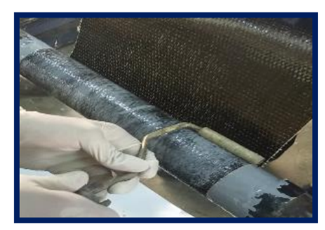
3. Composite Wrapping

For more information, please contact our representative: